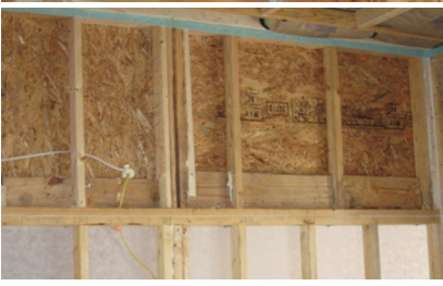
Many high performance improvements require attention to detail rather than a large investment. Electrical and plumbing holes were carefully sealed. Sill plate gasketing was used to seal sheetrock to the top plate. This is one of many low-cost improvements listed on the ENERGY STAR Thermal Bypass Checklist.